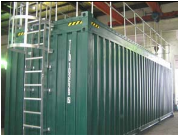
Above: Water Treatment Tanks