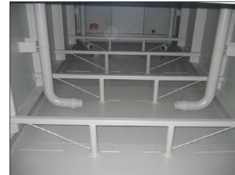
Right: An epoxy lined treatment tanks

Right: Stacked to create infinite process storage capabilities.