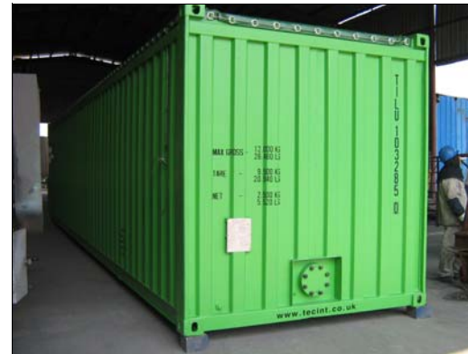
Left: Water storage tank shipped with tarpaulin